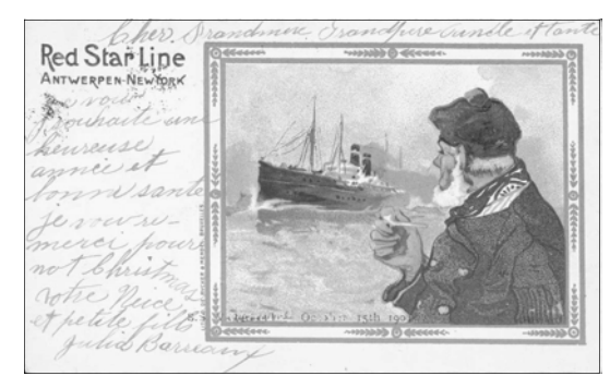
Red Star Line, postcard, ca. 1900 Antwerp, Van Mieghem Museum

On the Belgian side, it will renovate three original Red Star Line warehouses where emigrants underwent medical examination prior to departure and where they were disinfected and their papers were checked. On the American side, Antwerp has teamed up with the Ellis Island Immigration Museum to exchange scientific and genealogical research, and with the South Street Seaport Museum in New York to present a special exhibition.